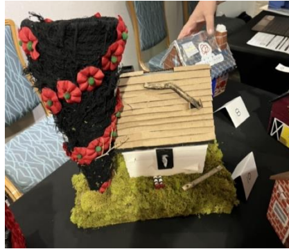
Dept. of CA